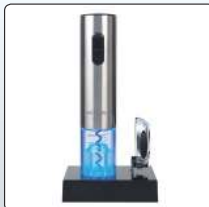
Secura Electric Wine Opener