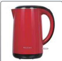
Secura Electric Water Kettle