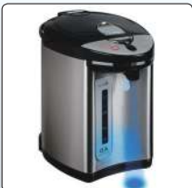
Secura Electric Hot Pot Kettle